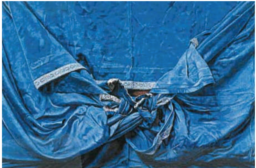
Tying the knot of dedicated service

“In the great day of the kingdom judgment, many will say to me, ‘Did we not prophesy in your name and