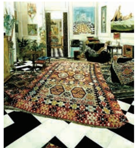
Madrid House, by Salvador Maron

M ASTER PAINTER, SALVADOR MARON, a native of the Canary Islands, has been painting creations of beauty for nearly 50 years. Presently based in Los Angeles, Sal, as he is affectionately called, is the painter of an astounding array of magnificent work that includes landscapes and gardens that beckon your footsteps, live flowers and blossoms captured in perpetual freshness, interiors and objects of such intricate detail that even upon close inspection you think they are photographs, portraits and oil sketches that convey the essence of personality targeted in a fleeting moment of time, and mysteries of draped canvases and unfathomable knots that symbolize and engage