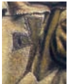
JESUS OF NAZARETH

T HEN JESUS SPOKE SAYING: “Now that you are ambassadors of my Father’s kingdom, you have thereby become a class of men separate and distinct from all other men on earth. You are not now as men among men but as the enlightened citizens of another and heavenly country among the ignorant creatures of this dark world. Of the teacher more is expected than of the pupil; of the master more is required than of the servant. Of the citizens of the heavenly kingdom more is required than of the citizens of the earthly rule. Some of the things which I am about to say to you may seem hard, but you have elected to represent me in the world even as I now represent the Father; and as my agents on earth you will be obligated to abide by those teachings and practices which are reflective of my ideals of mortal living on the worlds of space, and which I exemplify in my earth life of revealing the Father who is in heaven.